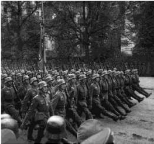
September 1 1939 German troops invade Poland.