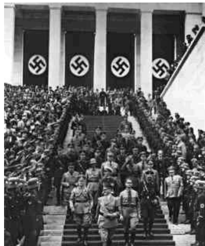
1933 The Nazi Party came to power in Germany. They were led by Adolf Hitler.