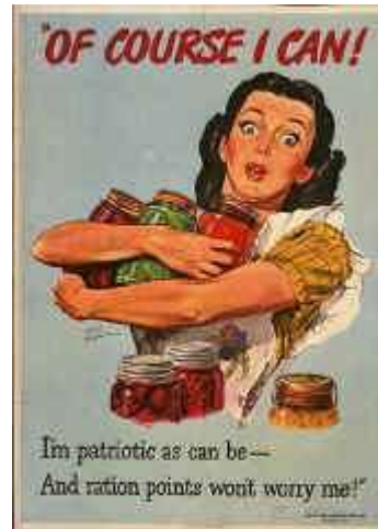
Jan 8 1940 The rationing of butter, bacon and sugar is introduced in Britain.