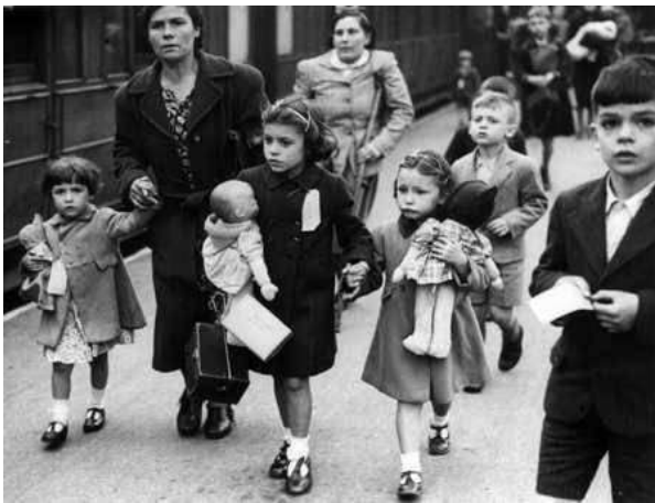
September 1939 In Britain, evacuation of children to safe areas begins.