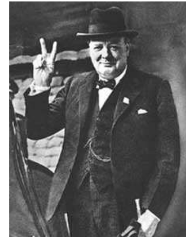
May 11 1940 Winston Churchill becomes Prime Minister of Britain.