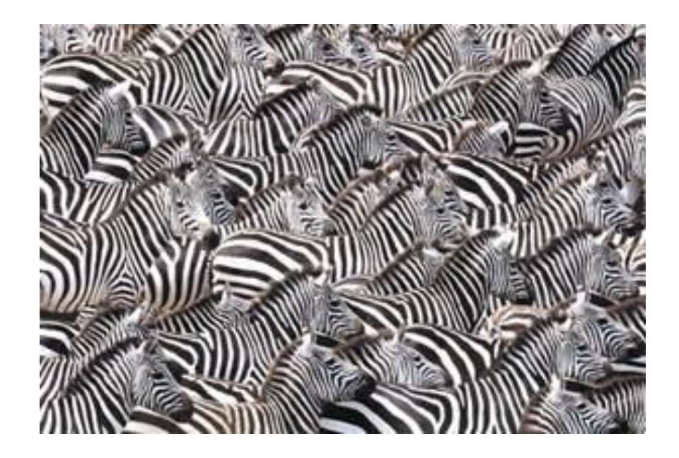
Zebra stripes make it difficult for predators to see one individual zebra to attack

Zebras are best known for their white and black stripes. Did you know that every zebras has a different pattern? This is just like the spots on a giraffe. Their stripes are a form of camouflage which makes it difficult to see the outline of the body or for a predator to spot a specific individual.