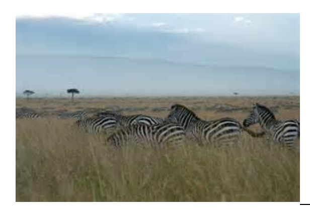
Zebras in treeless grasslands

They usually live in treeless grasslands and savanna woodlands whilst they stay away from deserts, rainforests, and wetlands.