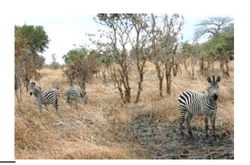
Zebras in Savannah woodlands