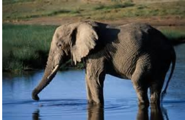
An elephant drinking

Did you know that African elephants have two things which are like fingers on the end of their trunk? This helps them to pick up things.