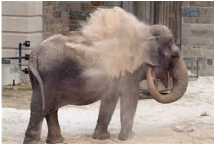
An elephant is spraying itself with sand to cool down.