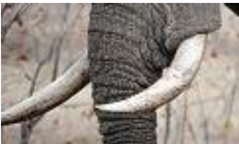
An elephant's tusks

Elephants use their tusks to dig or scrape the bark off of trees. Sometimes they use them to fight. Their tusks can be up to 10 feet long.